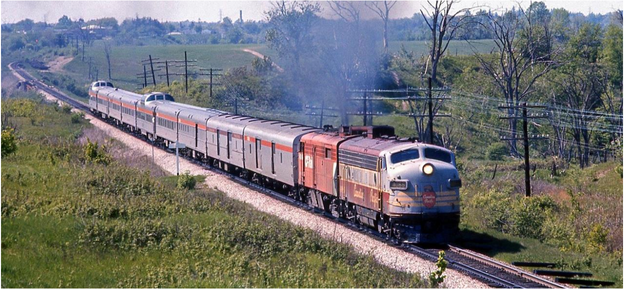
TORONTO-BOUND: After passing through Woodbridge, the Sudbury-Toronto section of The Canadian crosses the Humber River and heads south on the MacTier Subdivision in June 1971.