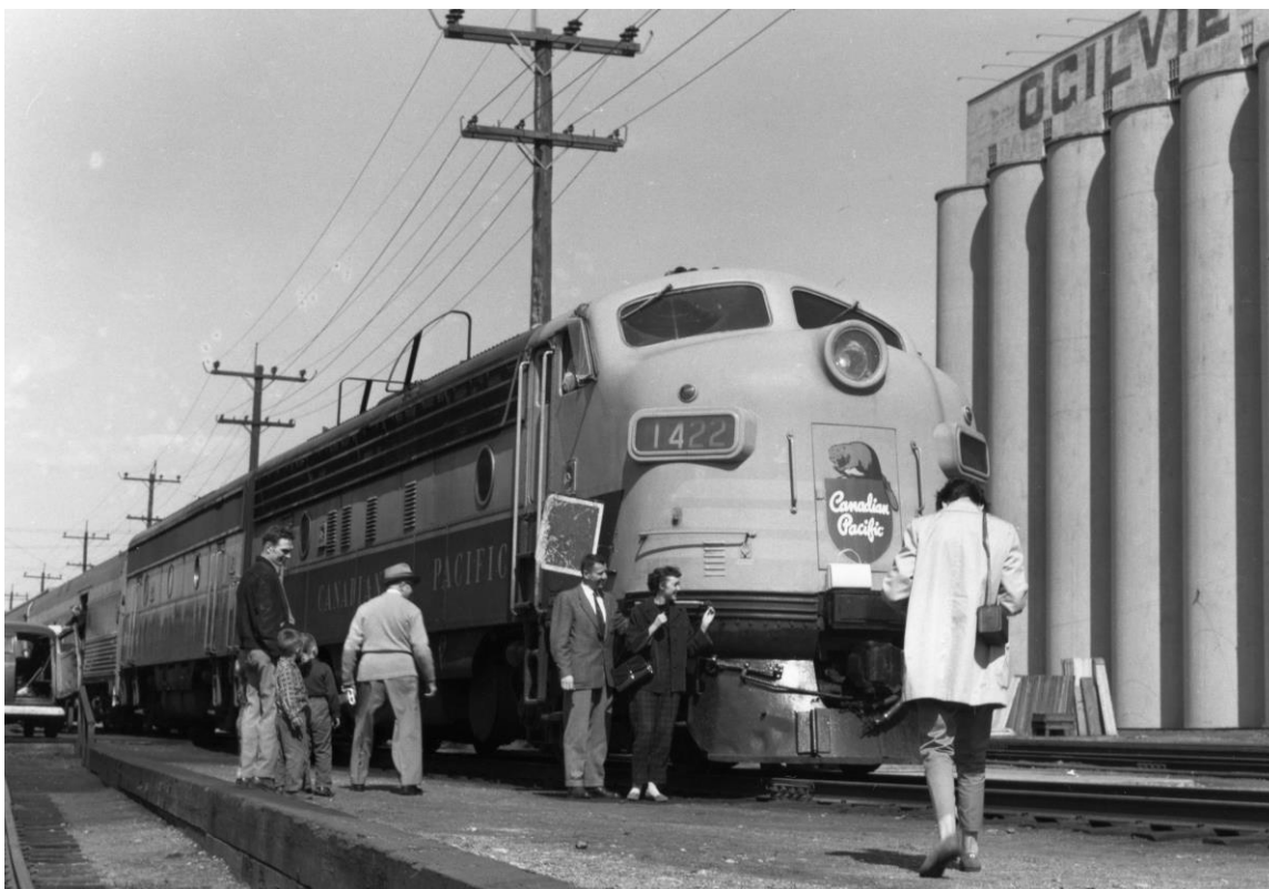
SHOW TIME: Passengers pose and little boys gawk as the svelte and powerful diesel-electric locomotives hauling The Canadian are serviced during the westbound streamliner's station stop in Thunder Bay – then Fort William – on April 19, 1958.

Thunder Bay brought another group of protestors. The big turnout had been the night before, when a large group gathered at a nearby arena and staged a candlelight march to the CPR station to meet the eastbound Canadian . We expected an even larger outpouring of protest and tears on the way back.