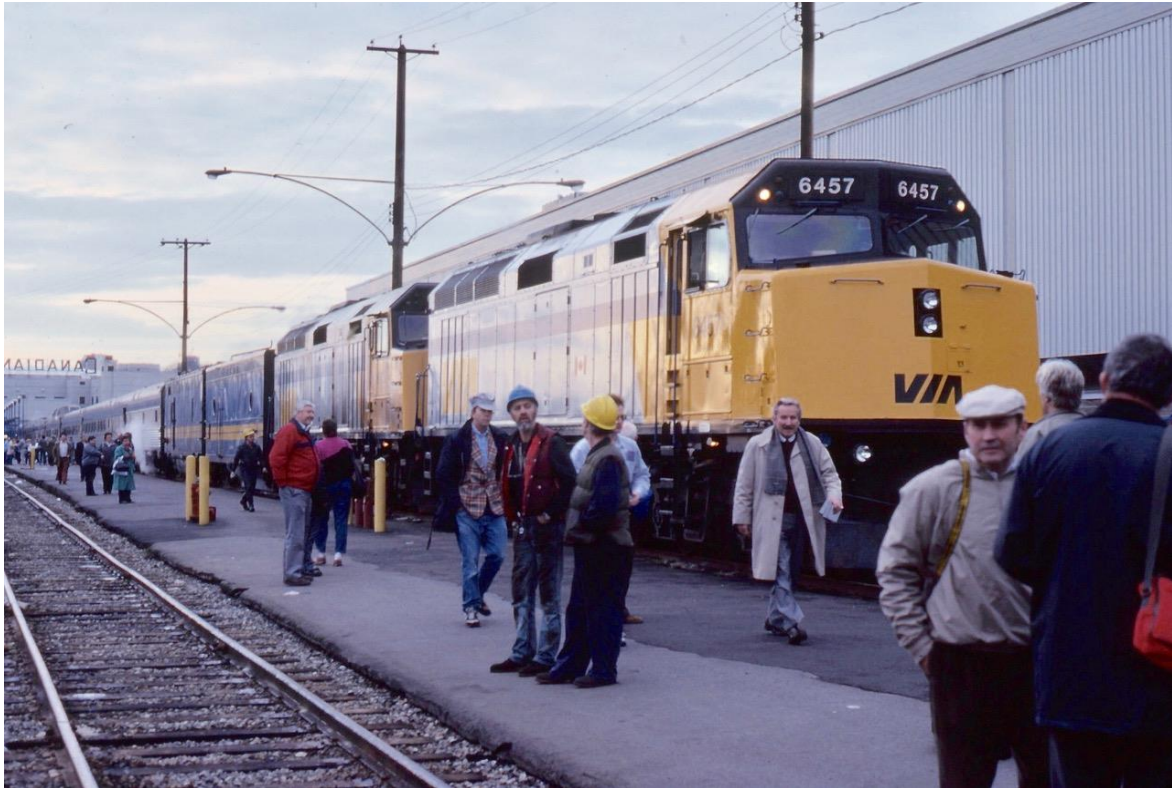
VANCOUVER, FAREWELL: Passengers, protestors, VIA employees, the media and heartbroken well-wishers mingle at Pacific Central Station as the last eastbound Canadian prepares to depart on January 14, 1990.