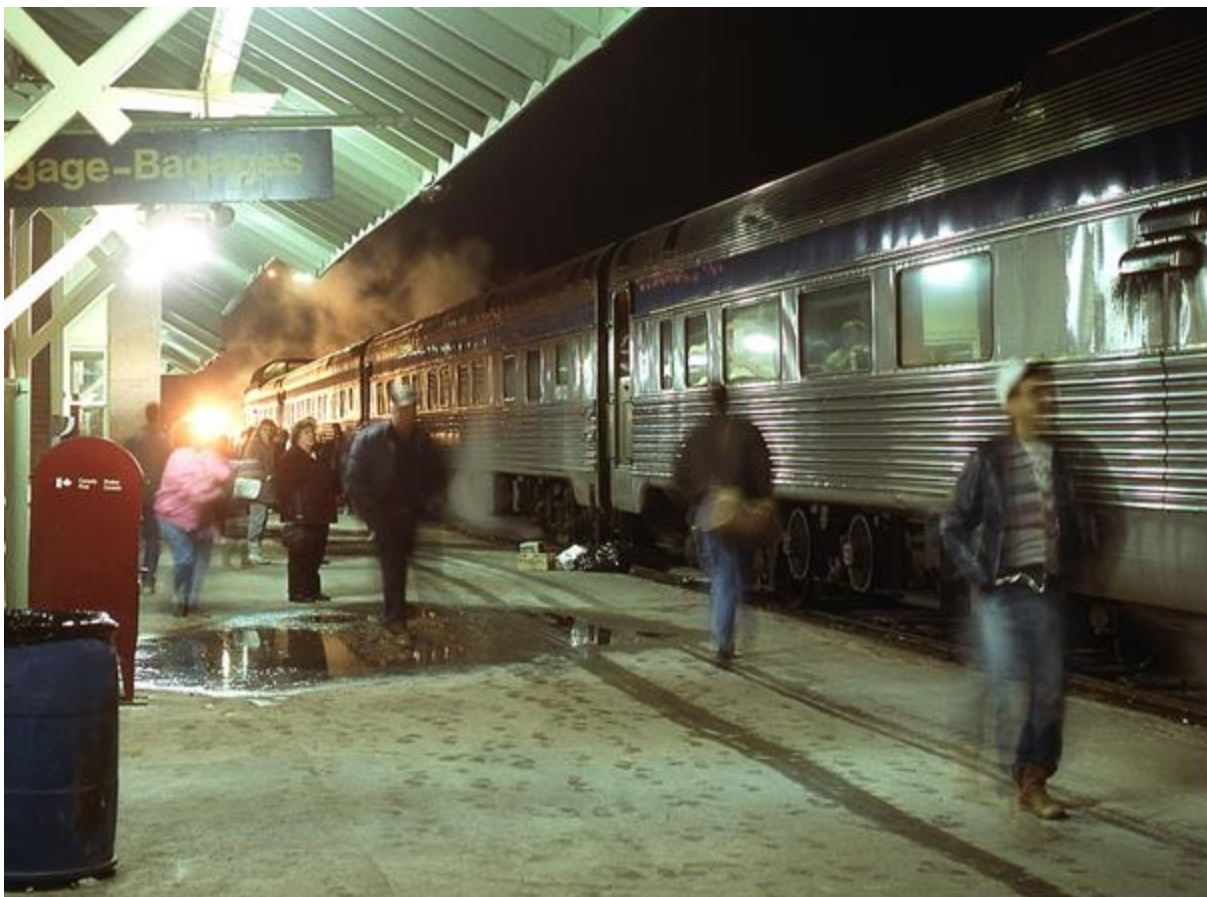
IT'S A JUNCTION: The Montreal and Toronto sections of VIA's Canadian are combined at Sudbury, and the headlight of the switcher doing the work is seen in the background.

The Sudbury stop revealed upsetting news. Near Petawawa, N o 1 had slammed into a pickup truck at a grade crossing, killing its two young occupants. The nose of F40 6409, sitting on the Sudbury house track with its steam generator and four ex-CN smooth-sided cars, had no damage save a broken ditch light and a scraped pilot. But its CPR engineer was on his last run with his family aboard, expecting to have a retirement party. The engineer was shaken and in no mood for a celebration.