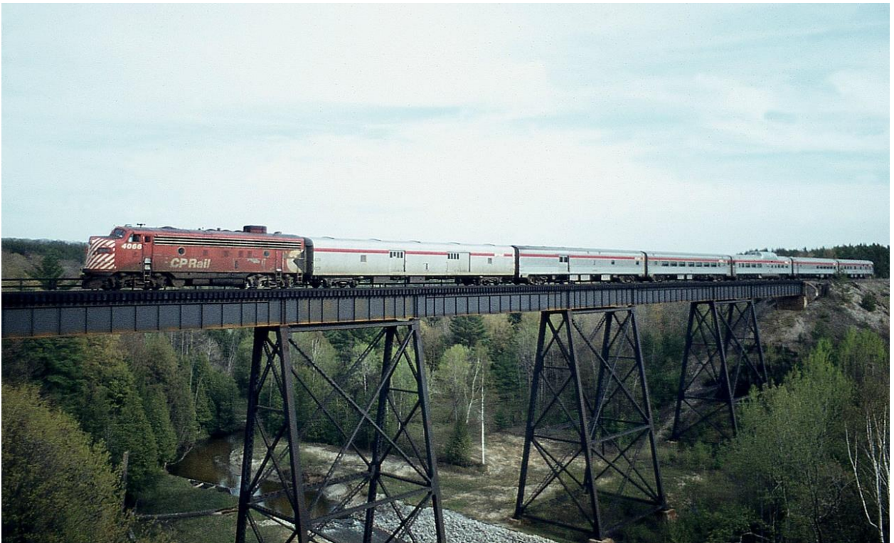
NORTHERN PASSAGE: The Toronto-Sudbury section of The Canadian makes its way north past the community of Midhurst on a pleasant June day in 1976.